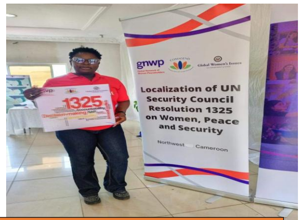
Workshop on localization of UN Security Council Resolution 1325, Oct, 2023

CAWAS also participated in a workshop organized by Comagend Cameroon in partnership with GNWP and Global Women’s Issues on UNSC 1325. The workshop focused on the localization of UN Security Council Resolution 1325 on Women, Peace, and Security in the Bali community of the North West Region. The workshop provided insight into the four pillars of UNSCR 1325, including participation and emphasized the importance of women's involvement in peace and security efforts.