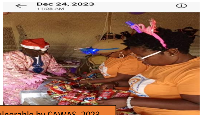
End year festivity support to the vulnerable by CAWAS, 2023

celebrations and gifts for widows, a party at the Good Shepherd Home, support for women living with disabilities, and a New Year party at the Luc Menorah Foundation and the children's ward of the Bamenda Regional Hospital. These initiatives aimed to provide relief, joy, and support to vulnerable women, children, and families during the holiday season.