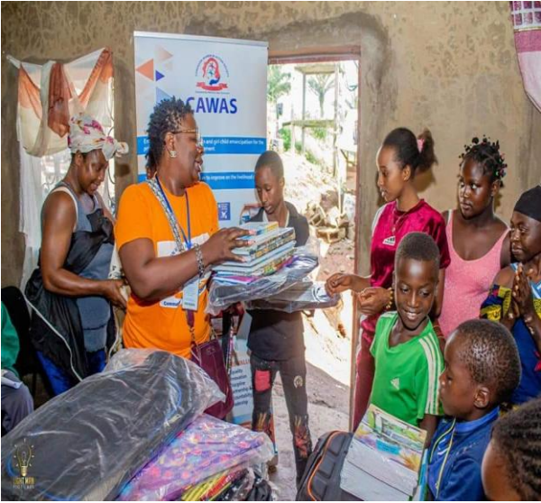
CAWAS assisting vulnerable children with back to School materials, 05/08/2023

On the 5th of September, CAWAS conducted a back-to-school campaign, providing school bags, books, pens, and learning materials to children and girls living with disabilities at the Luc Menorah Foundation. The initiative aimed to ensure that children with disabilities have access to quality education and the necessary resources to pursue their academic aspirations. Additionally, the