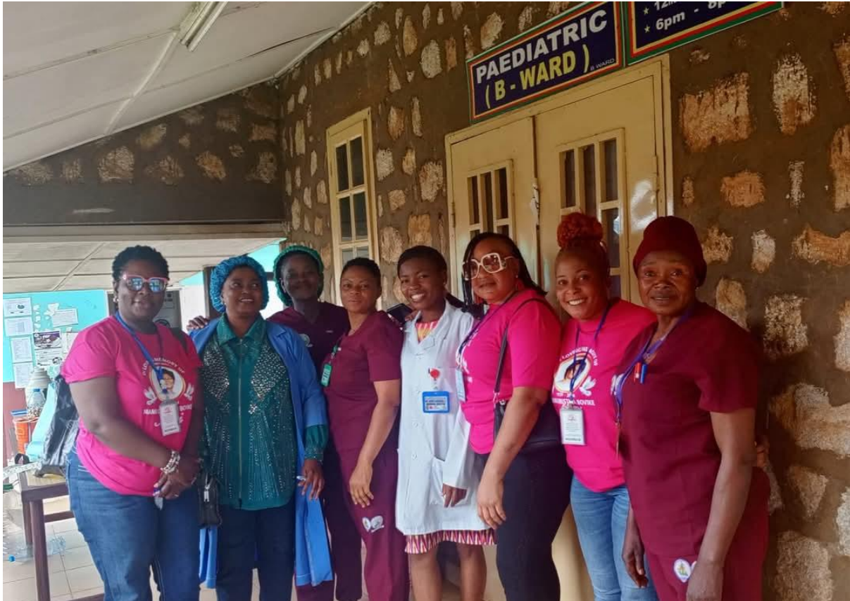
UN Women in Yaoundé