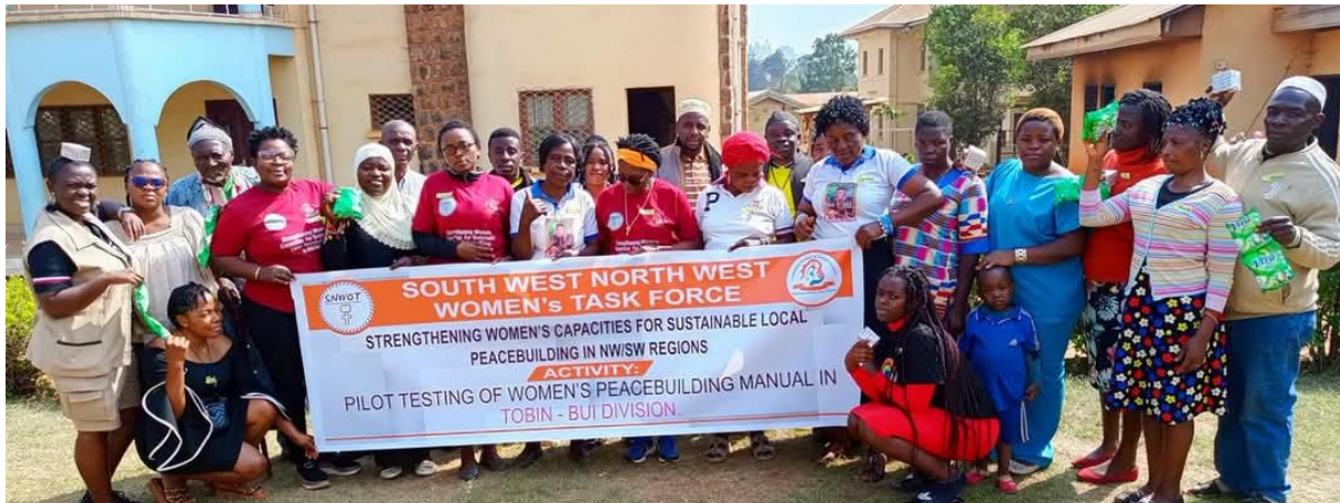
CAWAS leads a team in partnership with SNWOT in Bui division