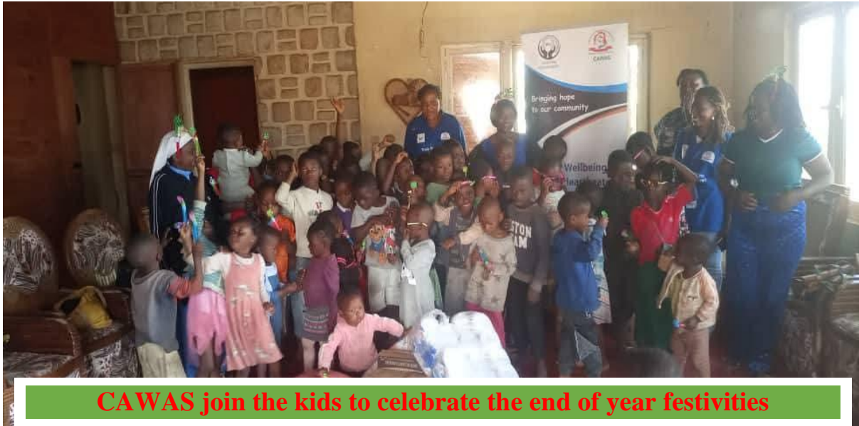
CAWAS join the kids to celebrate the end of year festivities