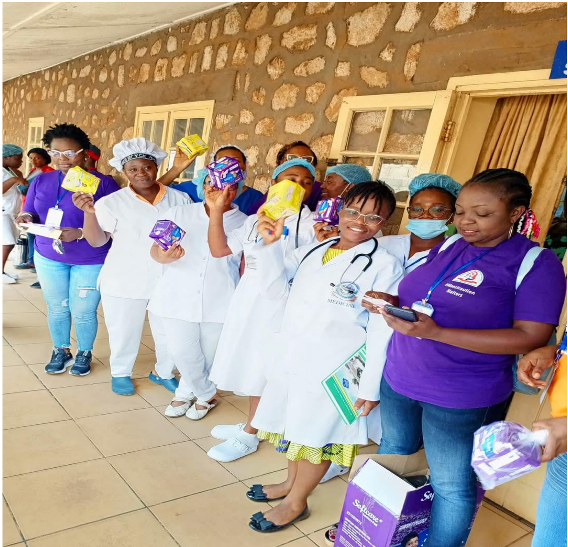
CAWAS takes part in World Menstrual Hygiene day 2024