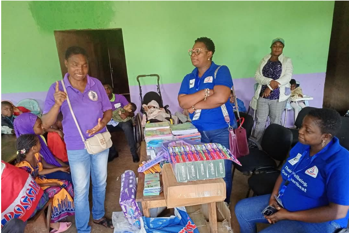
CAWAS in 2024 back to school relief